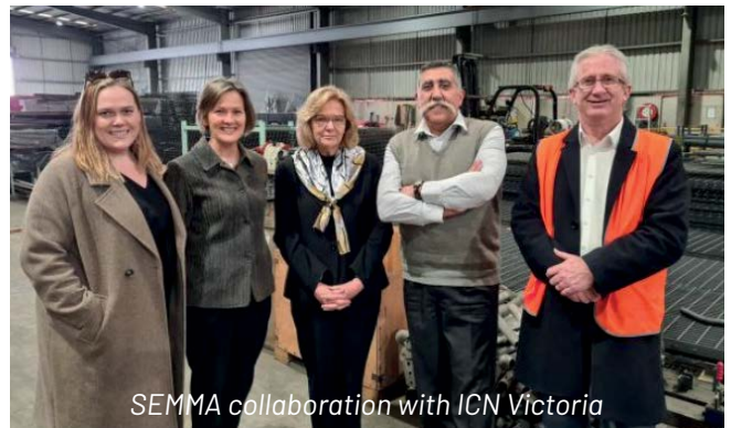
SEMMA collaboration with ICN Victoria